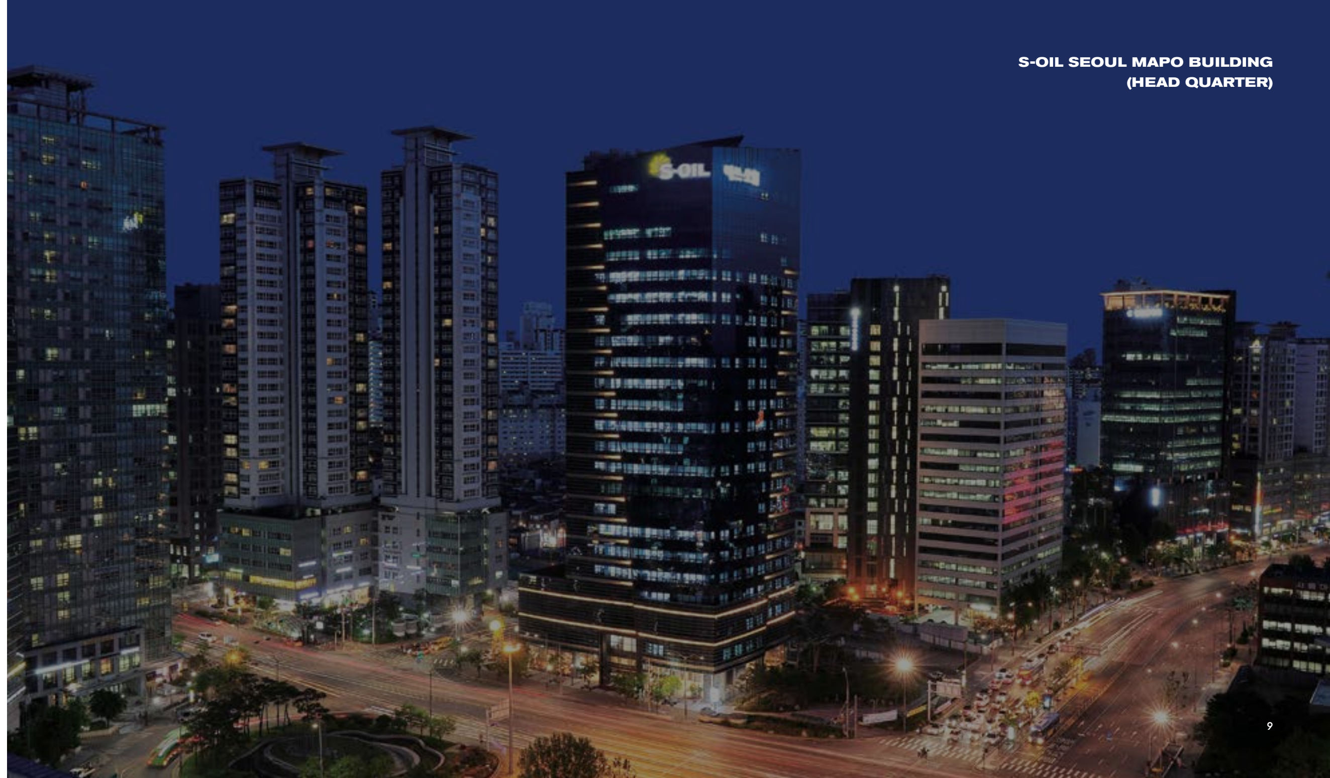
S-OIL SEOUL MAPO BUILDING (HEAD QUARTER)

Moreover, S-OIL has kept its reputation as a leading oil refinery company as it was recognized for having technologies in various special products other than automotive engine oils by supplying special oils such as engine oils for construction equipment and hydraulic oils to diverse industrial sectors in Korea.